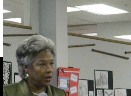
Joyce Beatty, Democratic challenger for the 3rd Congressional District