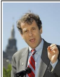
Senator Sherrod Brown, Democrat, Ohio.

His belief that the end justifies the means, that any dirty trick is ok as long as it furthers his ends and you don't get caught, is common knowledge. You can go on line and look up the dirty tricks attributed to him. But, they are only suspected, as he is very good at his job: whispering in the dark, sending unsigned letters, getting others to do his bidding. Let me put it this way. If I were running for office, and I had Karl Rove's support, I would not vote for me.